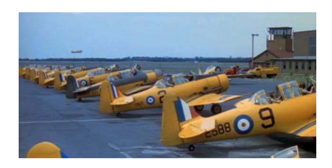
Uplands Harvards

menced of the Hollywood movie 'Captain of the Clouds' starring James Cagney, Dennis Morgan and Alan Hale on July 16, 1941 and included World War I flying ace Billy Bishop. [Ottawa Citizen, July 16, 1941 p.1] The film had general release in the United States on February 21, 1942.