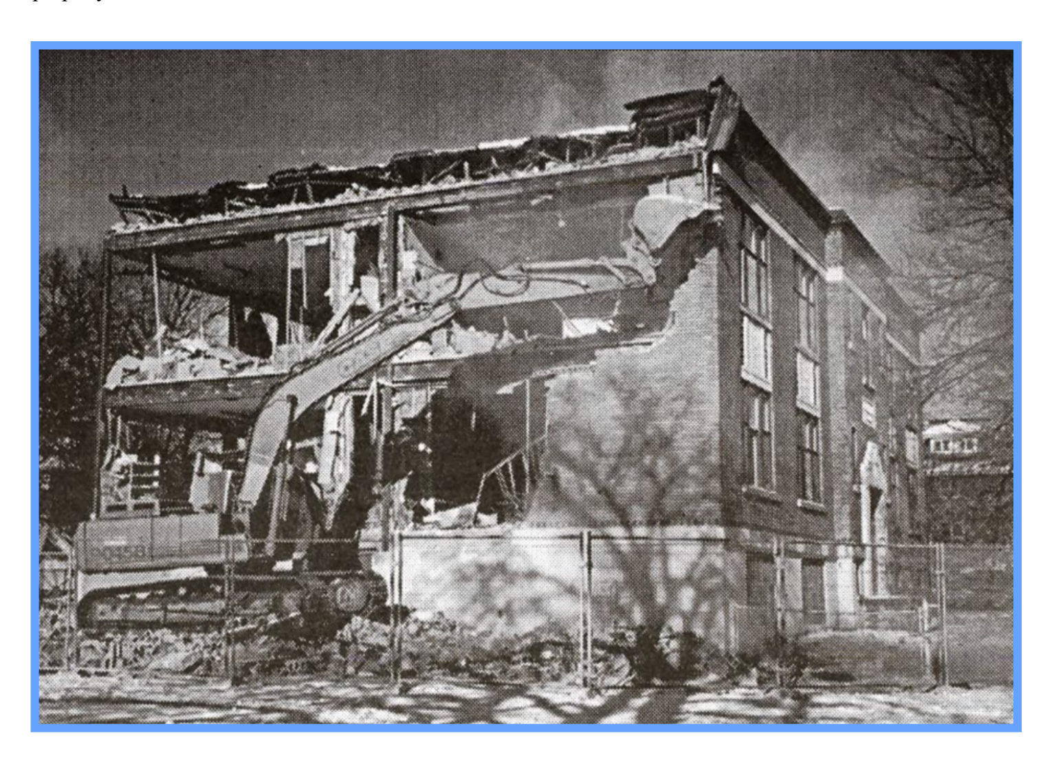
Demolition of St. Margaret Mary Catholic School in December 2004