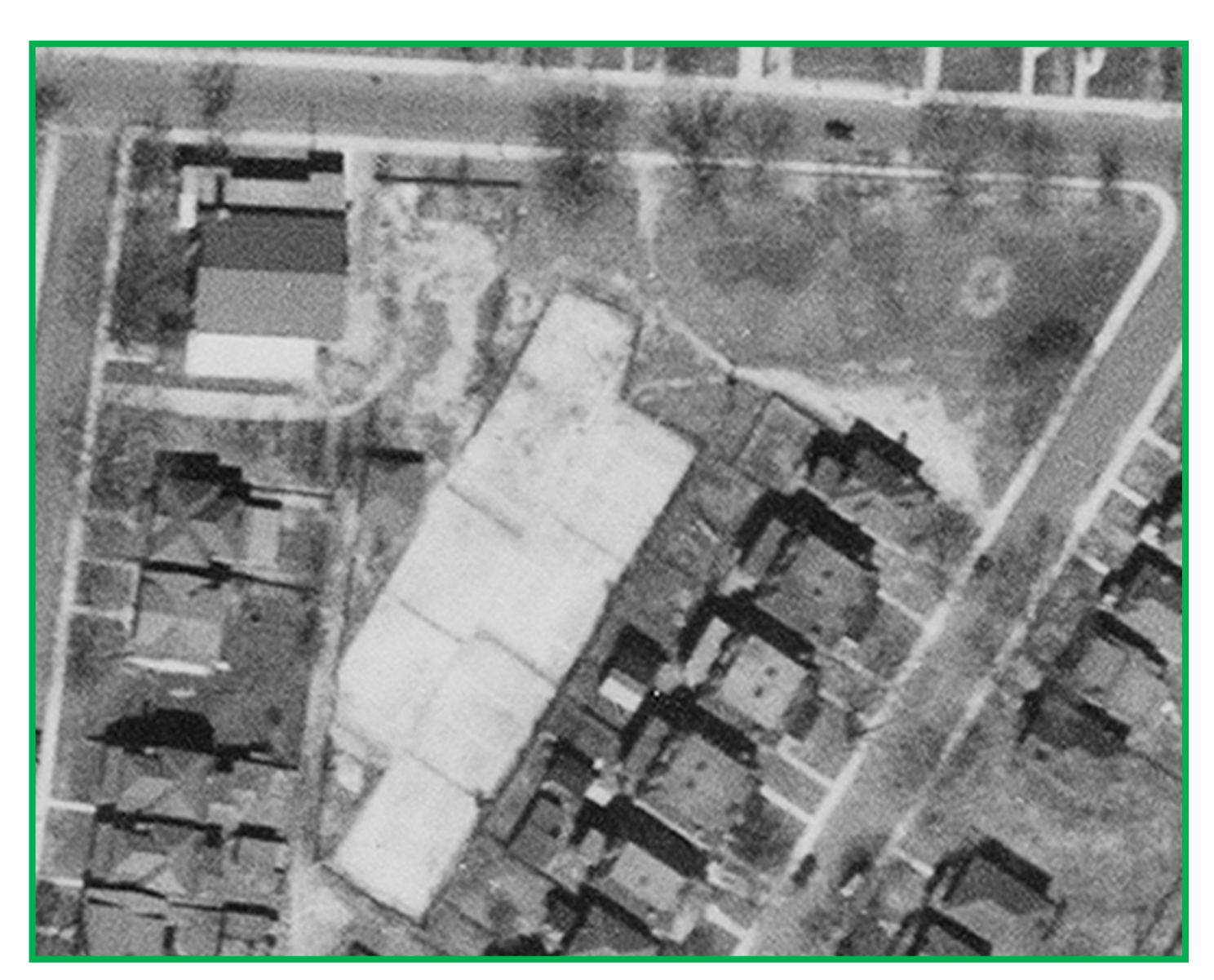
This 1933 air photograph shows the Sunnyside Tennis Club in the middle of the block bound by Sunnyside Avenue to the north, Fairbairn Street to the west and Bellwood Avenue to the east. St. Margaret Mary Roman Catholic Church appears immediately north-west of the tennis courts at the Sunnyside-Fairbairn intersection.

The new school, St. Margaret Mary Separate School (later simply St. Margaret Mary School) at 88